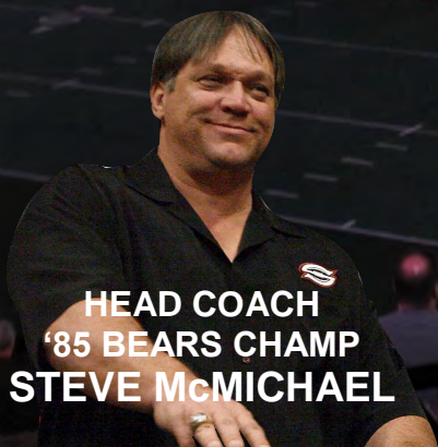
HEAD COACH '85 BEARS CHAMP STEVE McMICHAEL