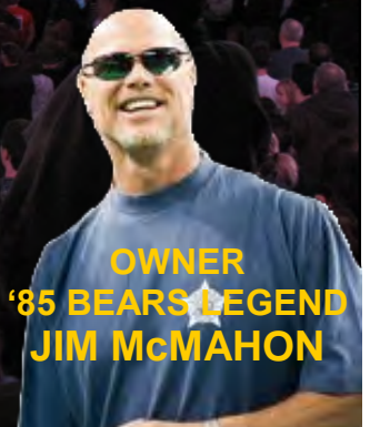
OWNER '85 BEARS LEGEND JIM McMAHON