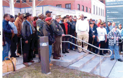
CVO press conference at the kick-off of the Washington, DC trip.

CVO has been active over the years. The first major action was to take over 100 veterans and three buses to Washington, D.C. The city of Country Club Hills supported this effort. In Washington, the veterans met with and briefed our Congressional representatives and senators. The meetings lasted all day and were deemed quite successful. Besides numerous individual Congressmen, we met with the Senate Veterans Affairs Committee. A smaller group returned to Washington in 2008, carrying the message of the need for universal health care without copayments for all veterans.