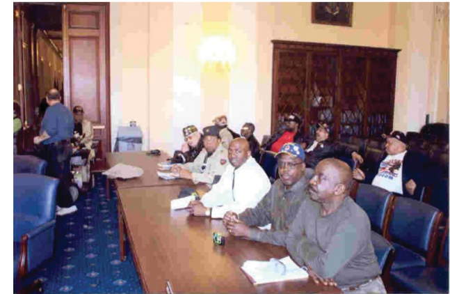
CVO at the U.S. Senate Veterans Affairs Committee